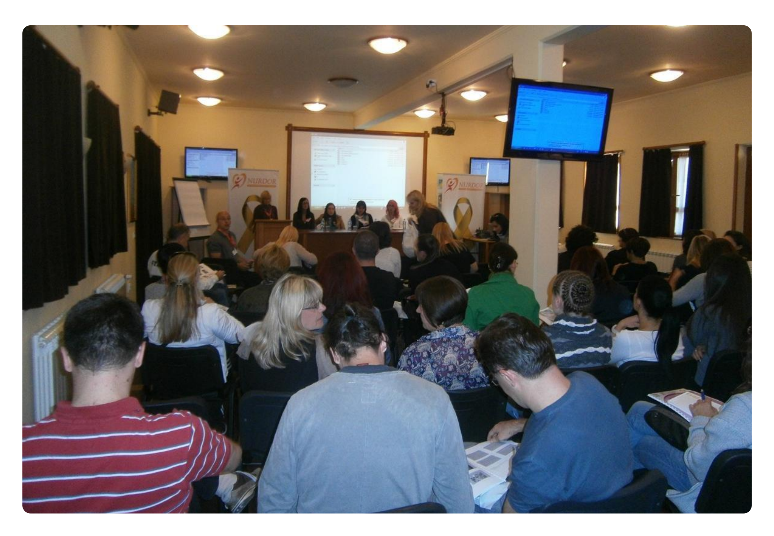
The first joint educational seminars for the medical staff from all the five hemato-oncological departments