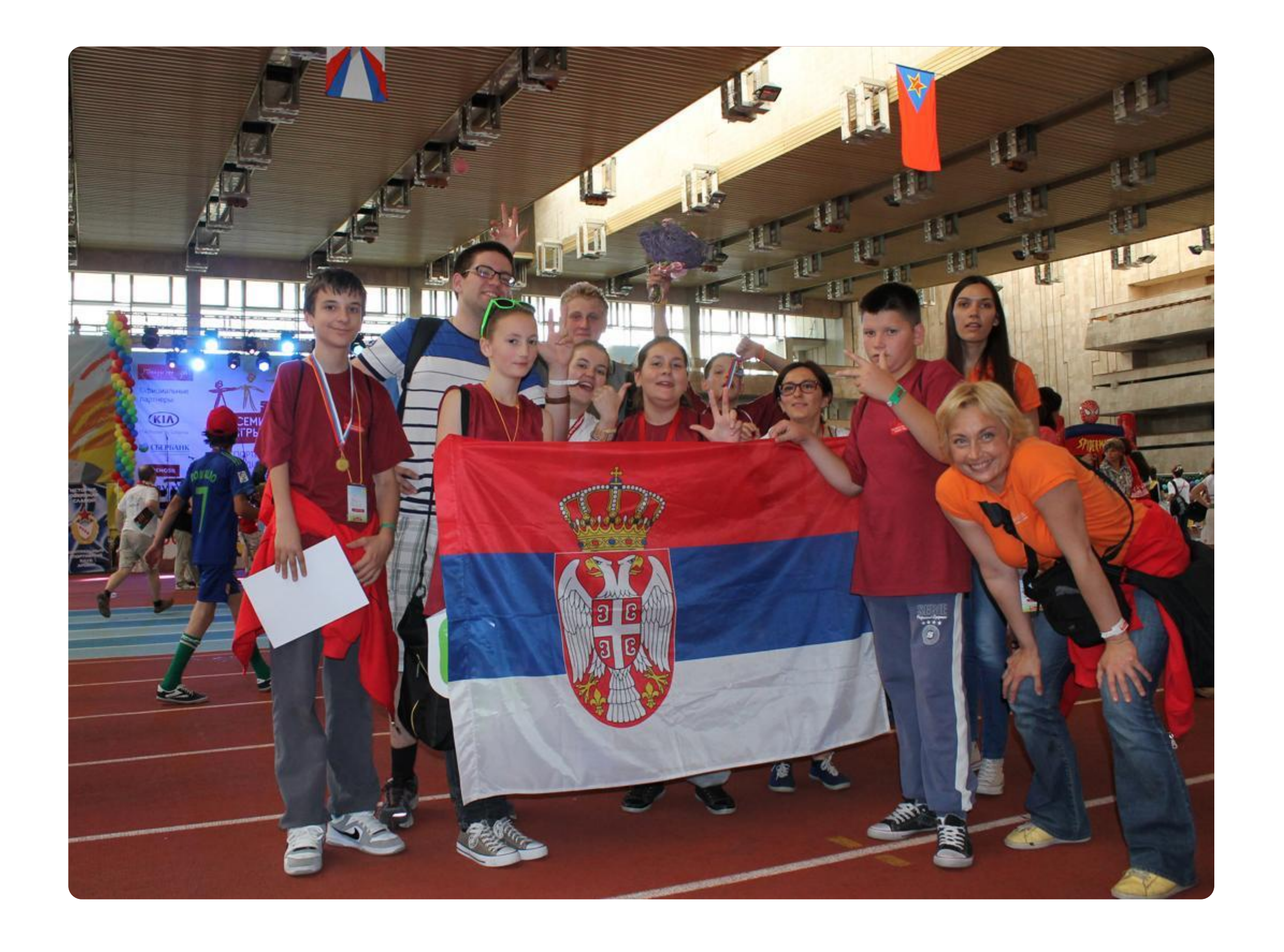
The Children Winner Games, Moscow