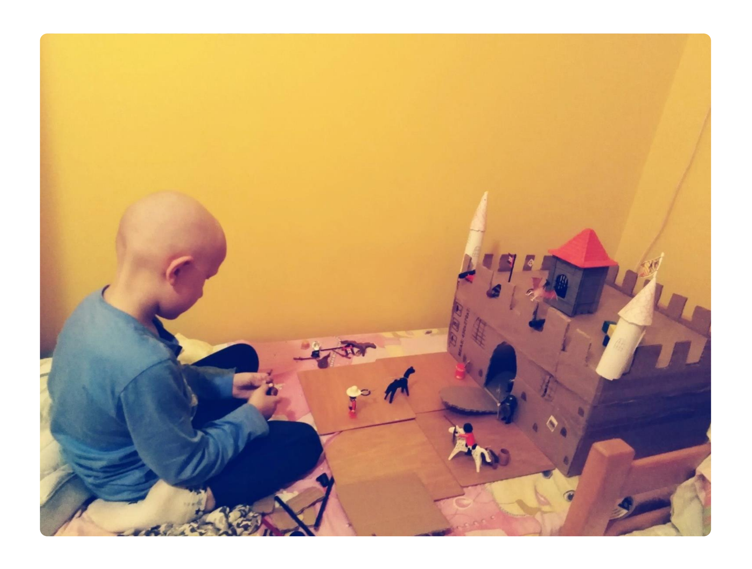
The little magician in the Parent house, Belgrade