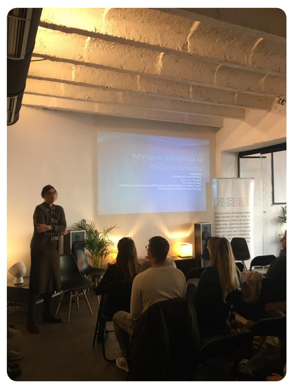
The seminars for volunteers, Belgrade 2019