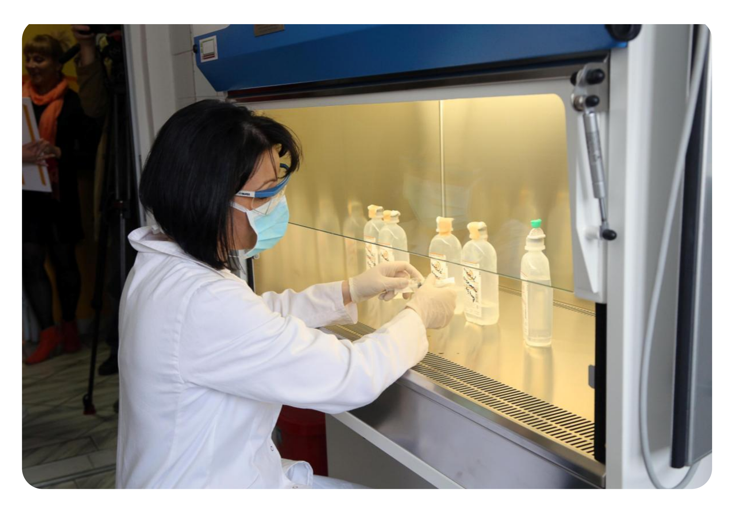
Laminar flow chamber for cytostatic drugs mixing, Institute for Health Protection of Children and Youth of Vojvodina