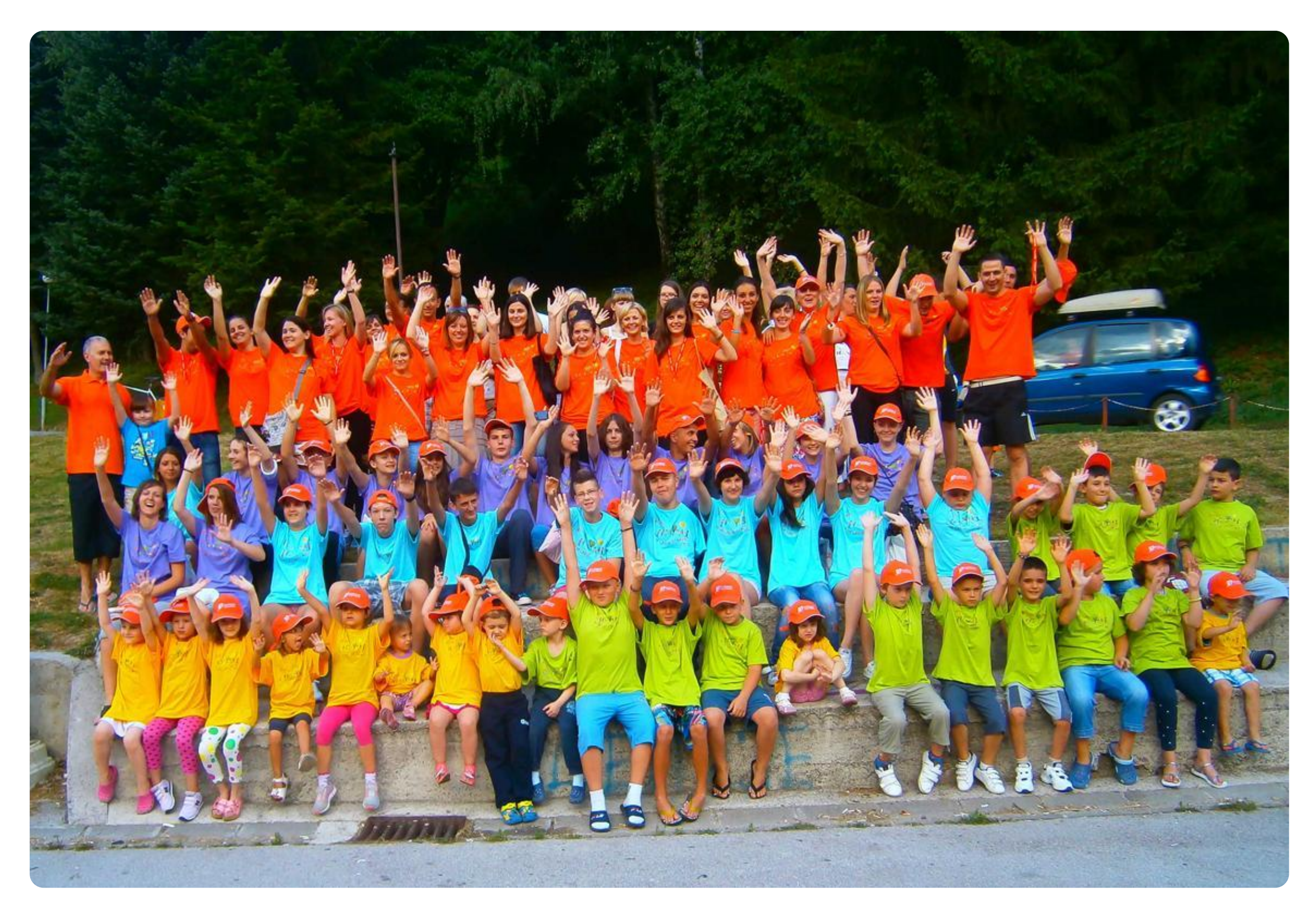
The international Summer Camp "Love and Hope" Ivanjica